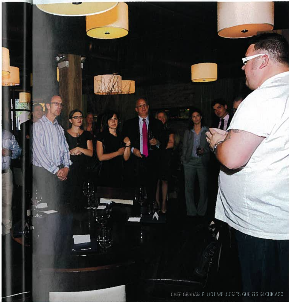
CHEF GRAHAM ELLIOT WELCOMES GUESTS IN CHICAGO