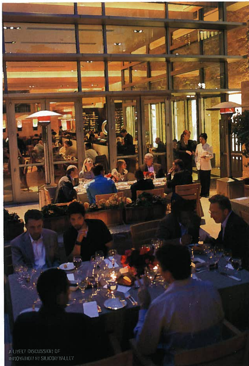
A LIVELY DISCUSSION OF INNOVATION IN SILICON VALLEY

Overall, there was consensus that innovation is indeed the road to the future. Things we could never have imagined 50 years ago—instant access to information, virtual cooking schools, and making a restaurant reservation with a click—have become